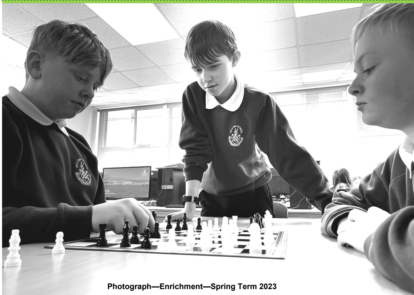
Photograph—Enrichment—Spring Term 2023

“Education is the most powerful weapon which you can use to change the world.” — Nelson Mandela